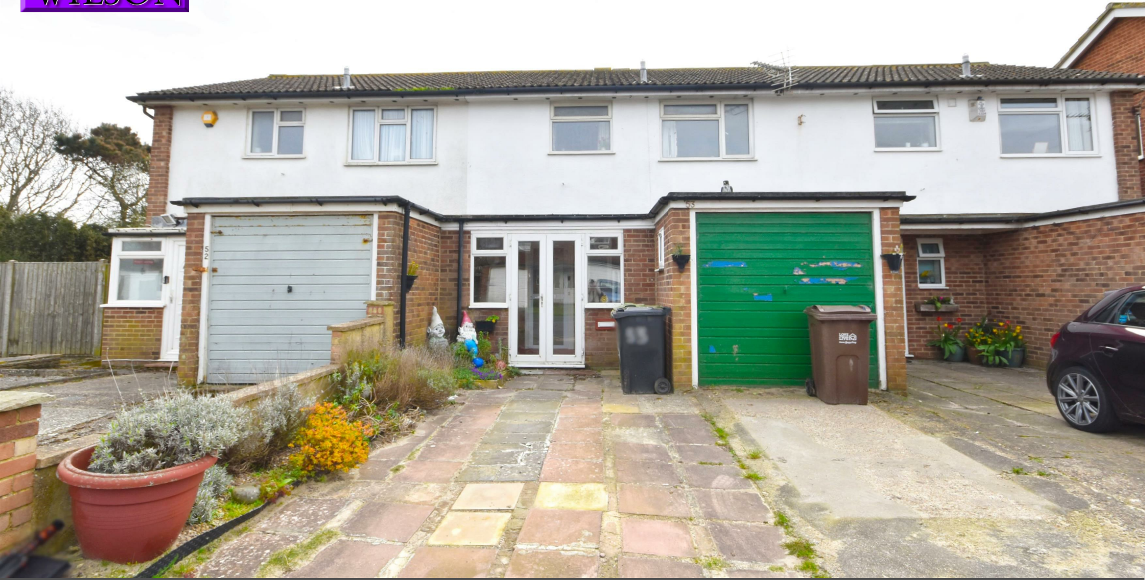
53 Denham Way, Camber, East Sussex TN31 7XR Guide Price £260,000